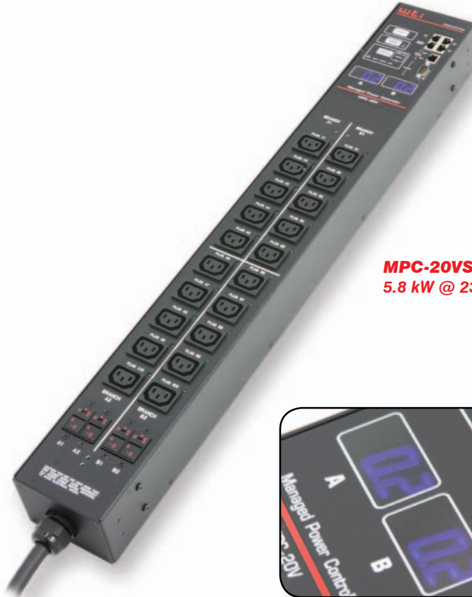
MPC-20VS32-3 5.8 kW @ 230V